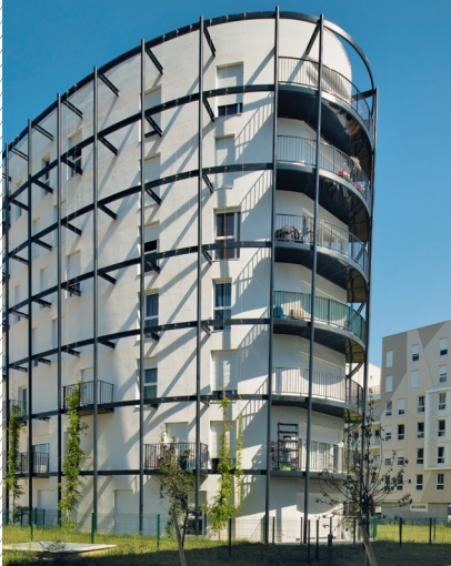
Fort d'Issy eco-neighbourhood, Issy-les-Moulineaux, near Paris

Housing, schools and universities, hospitals, hotels, office buildings, stadiums, airports, exhibition and leisure centres, etc.