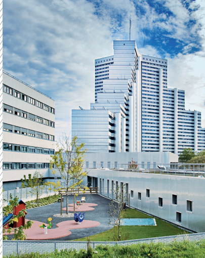
Sillon de Bretagne housing complex, Nantes, France