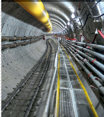
MTR 703 railway tunnels, Hong Kong

Underground works, engineering structures, tunnels, earthworks, road, rail and port infrastructures, public transport, etc.