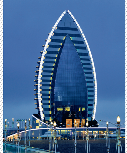
Yıldız Hotel, Ashgabat, Turkmenistan