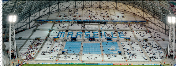
The Stade Vélodrome football stadium, Marseille, France

Management and operation of transport infrastructures, sports and entertainment facilities, ports, etc.