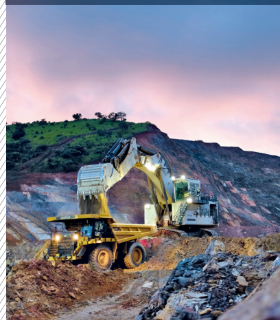
Gold mines in Kibali, Democratic Republic of Congo