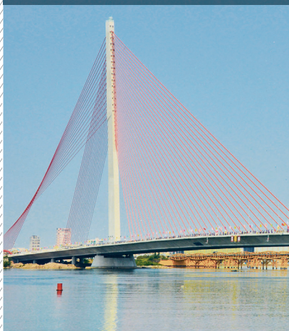
Tran Thi Ly bridge, Da Nang, Vietnam